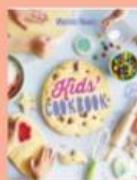
Magical Rainbow Slime 20 loans Kids Cook books 14 loans