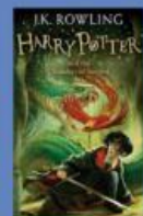
Harry Potter and the Chamber of Secrets 7 loans